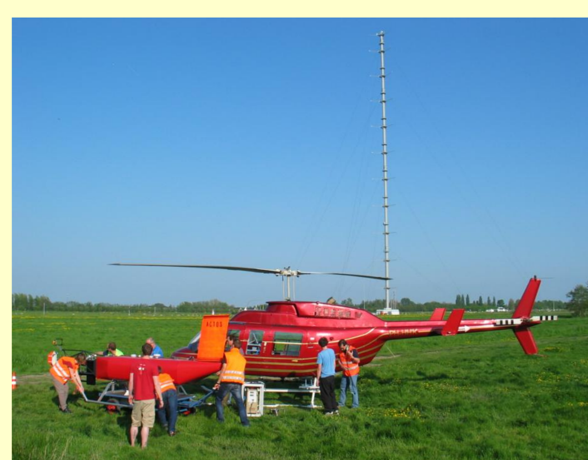
Bell 206 Long-Ranger (2) with ACTOS turbulenz platform