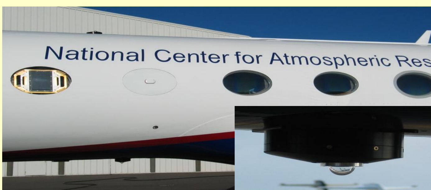
Stabilized solar radiation measurements on HIAPER