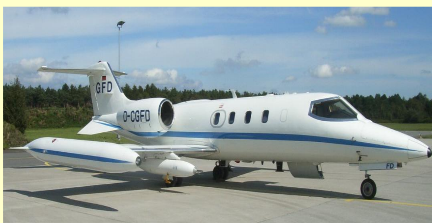
Learjet 35A, D-CGFD 1