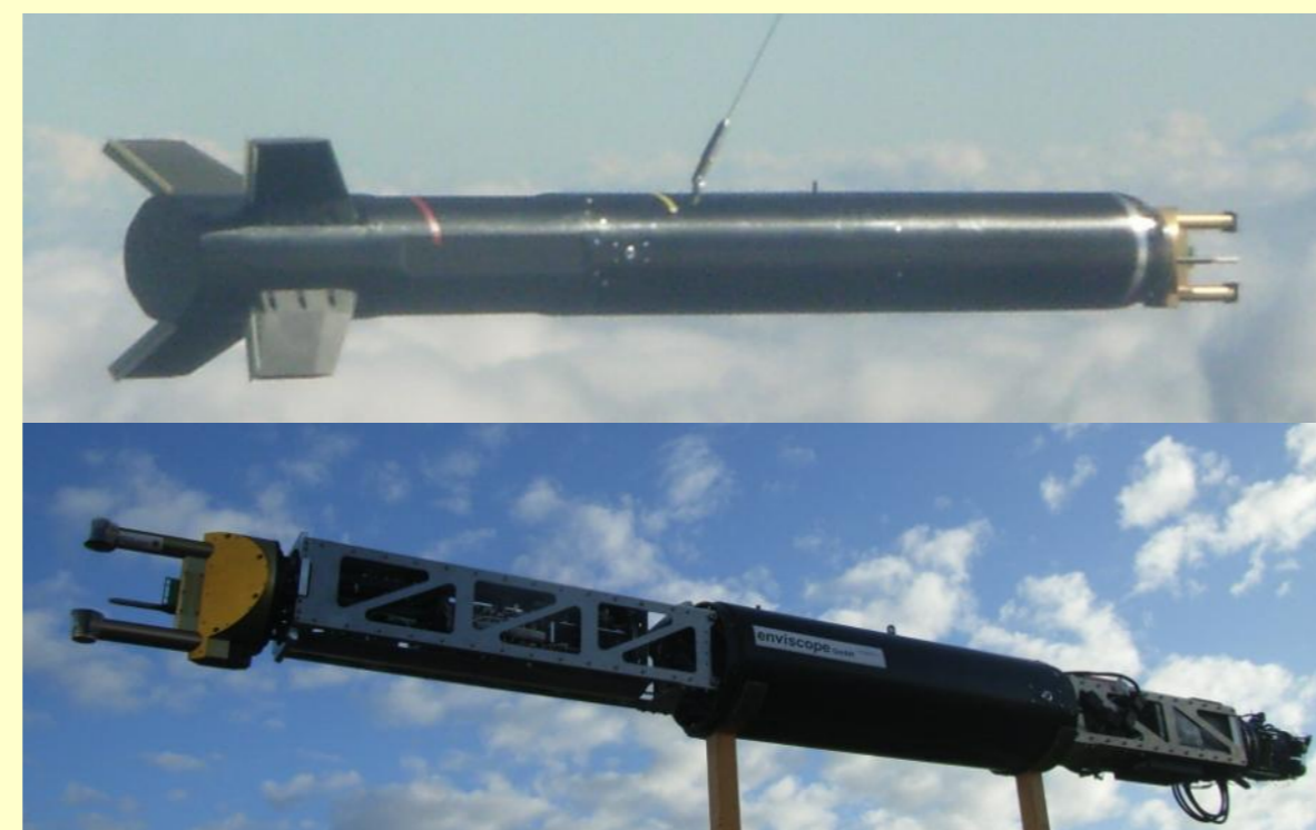
AIRCROSS- AIRcraft TOWed Sensor Shuttle

Component development for the temporary installation on-board of research aircraft is the main task of enviscope . Our service comprises feasibility studies, conception, design, construction as well as documentation for subsequent certification.