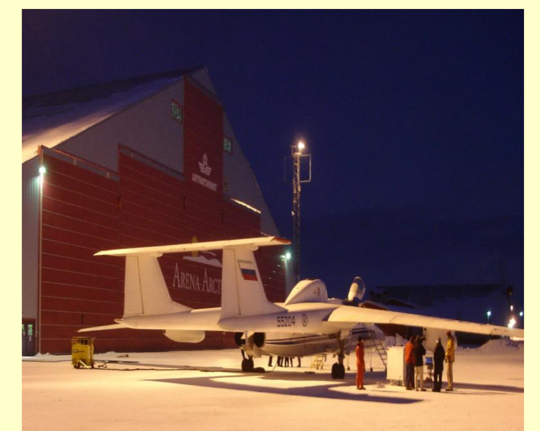
Logistic support during Geophysika-campaign "RECONCILE" 2010 in Kiruna