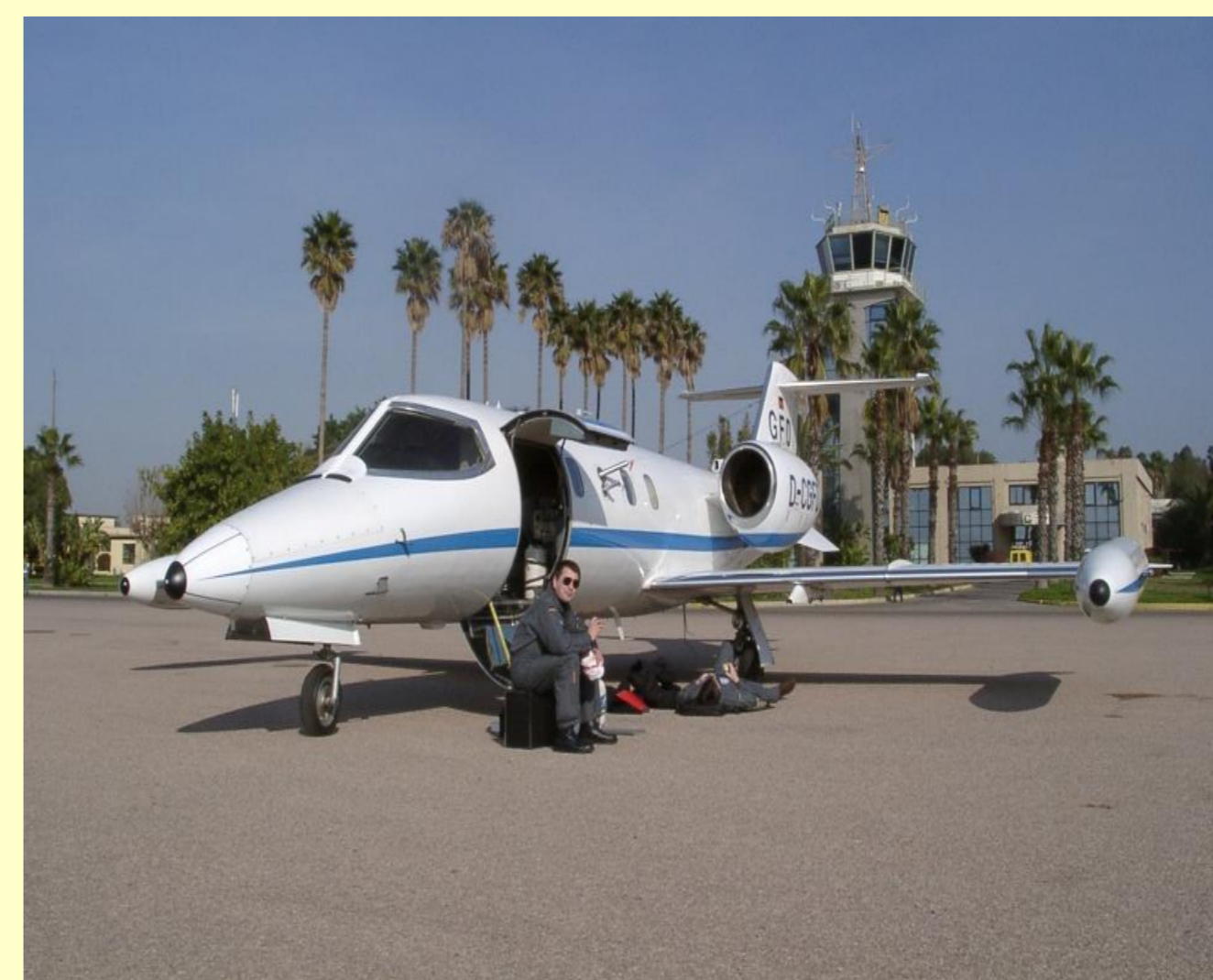
Stop over in Casablanca during one of the SPURT flights. SPURT aimed for meridian cross sections of the northern hemisphere from North Europe to North Africa within only two days.

enviscope GmbH has a long standing experience in supporting scientific field work. Since 1992 enviscope participated in numerous national and international research campaigns. We offer this service not only for our own aircraft but also for any other research activity.