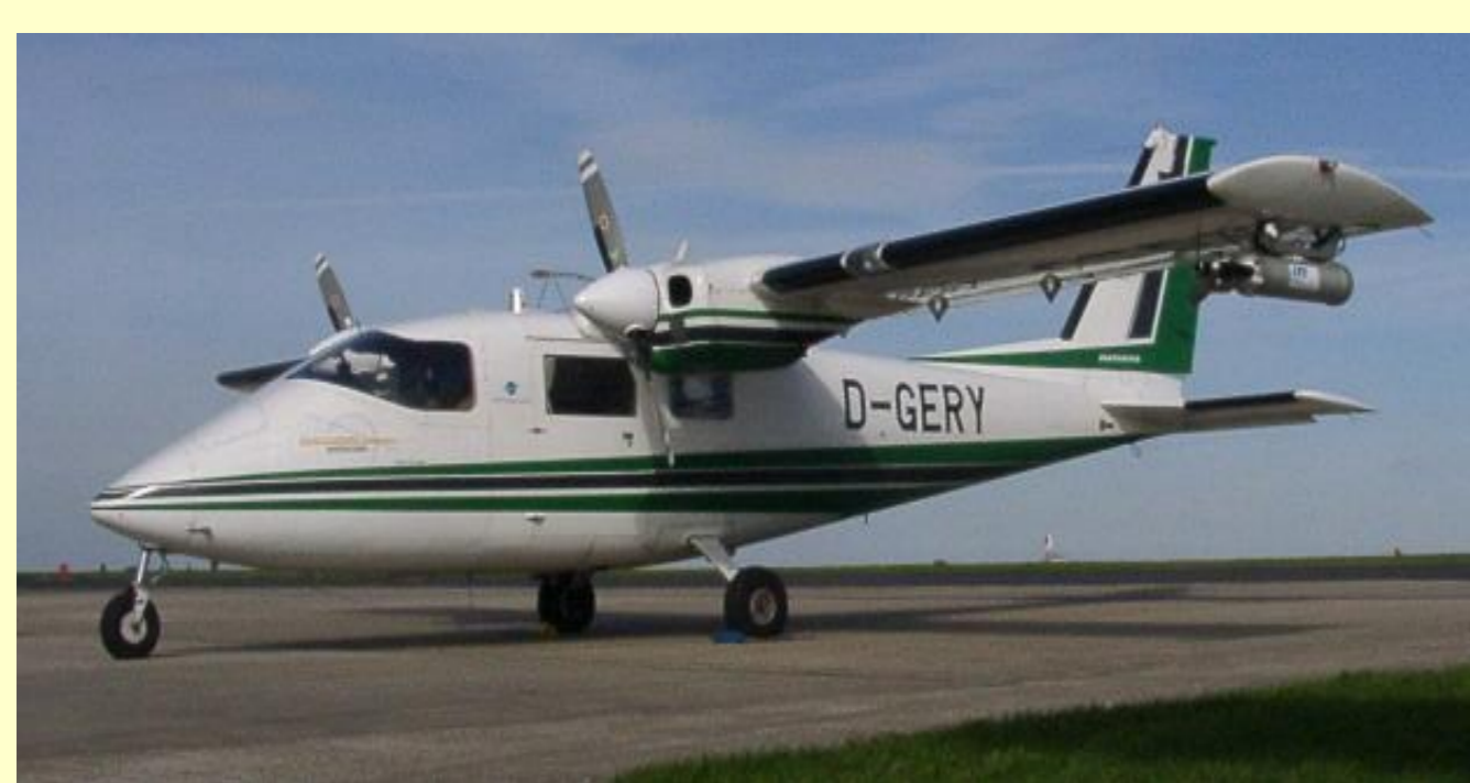
Partenavia P68 B, D-GERY

enviscope has a special concept to operate research platforms together with partners. We developed a basic research equipment for each of our platforms to enable the 'temporary use' only during the scientific employment.